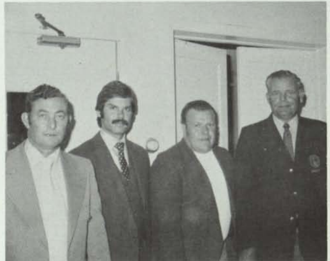
Continued somewhere else in this issue.