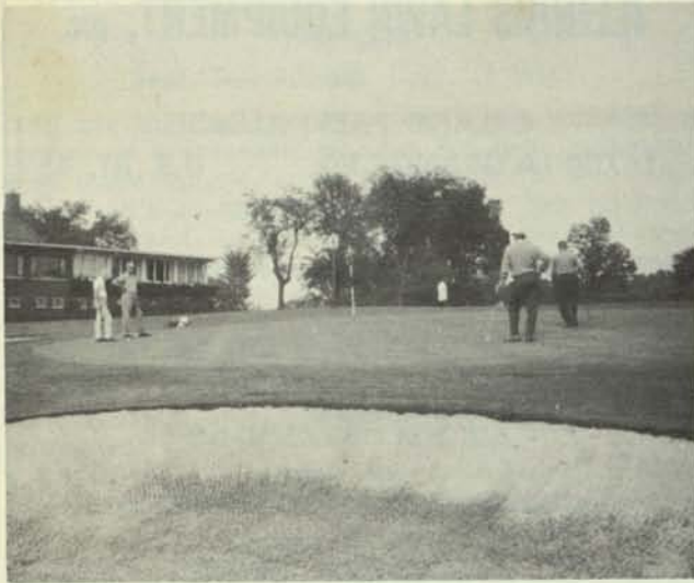
A foursome finishing up on No. 18 hole.