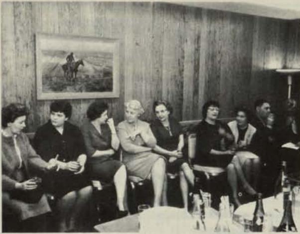
Wives of Midwest superintendents enjoying Hospitality Room at Cleveland.