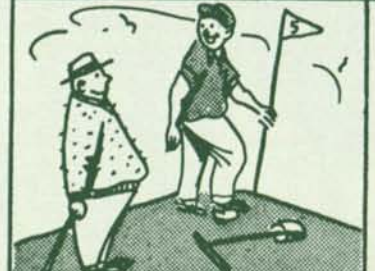
"Can't stop now, I have to get the cup in before this Fertil-Ade green closes the hole."

For 15 years Golf Course Superintendents have relied on Fertil-Ade or Aqua-Sol for Better Greens that stay Better.