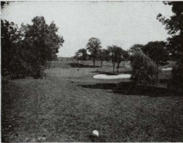
1st Hole at new "ROLLING HILLS COUNTRY CLUB"

The paths are 8 feet in width made of Hot Mix Asphalt two inches thick over four inches of gravel. The path surface is flush with the soil surface.