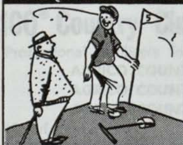
"Can't stop now, I have to get the cup in before this Fertil-Ade green closes the hole."