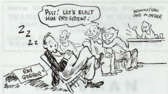
Caught napping by the Midwest Golf Course Supt's.