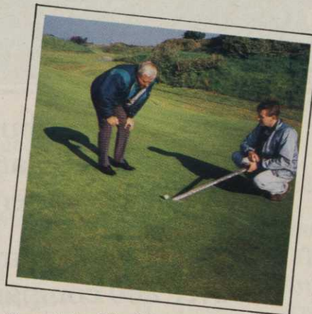
Three shots of the Stimpmeter in action.