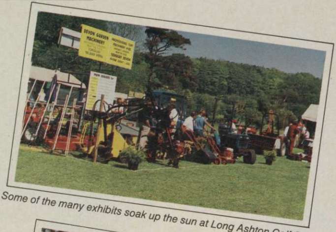
Some of the many exhibits soak up the sun at Long Ashton Golf Club.