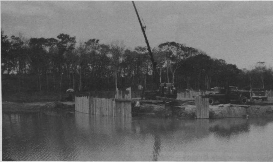
Island Green construction. The 7th at Round Hill.