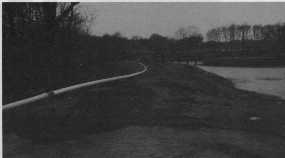
Drainage Piping. The 7th at Round Hill.

14 days to complete. Late February saw all of us putting in drains to the greens - stone, sand and mix - leaving two loads extra for repairs. The last pilings were in, an access road excavated and teeing grounds built. Ten days of ten degree weather & done!