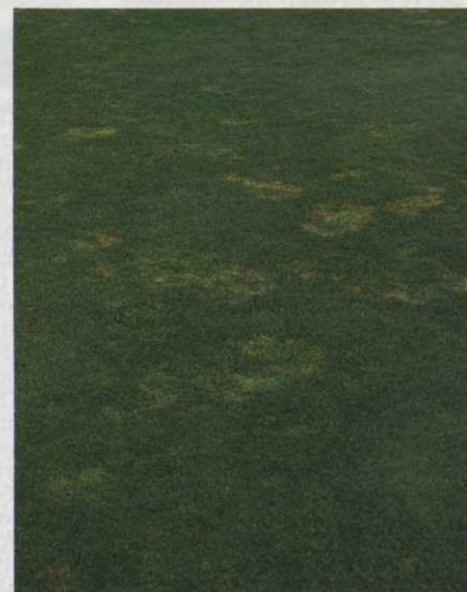
Fig. 2. Extensive damage by fusarium patch caused by applying fertiliser in early winter. The disease is favoured by high nitrogen conditions.