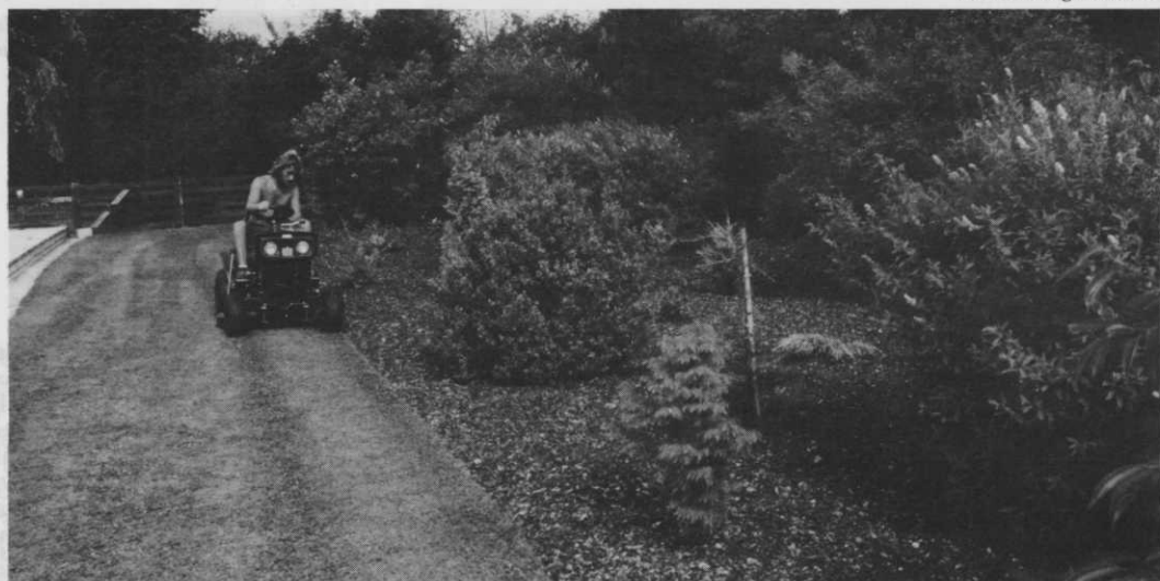
The practical efficiency of Bark Products is evident.

Both the landscaping, sports ground section and the specialist maintenance side of the company have expanded rapidly with three Captain Vertidrons.