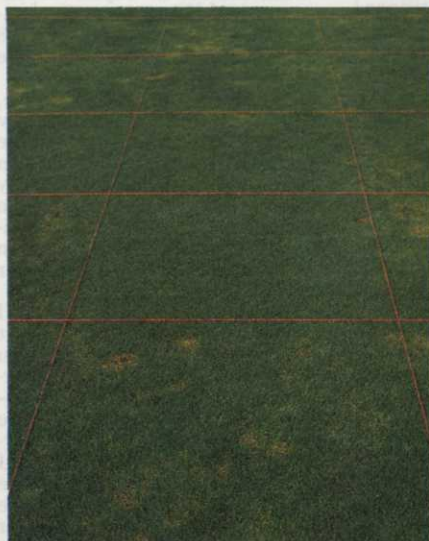
Fig. 4. The centre plot was treated with a systemic fungicide in late autumn. Compare to the extensive disease in the lower plot which was left untreated.