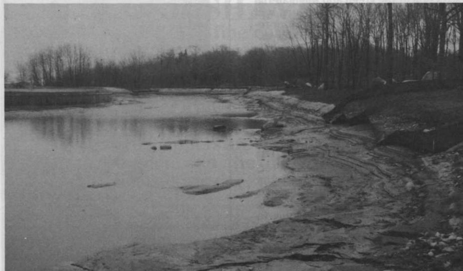
The Pond at its lowest level.

Winter arrived and with everyone urging the faceless ones that we be allowed to finish the job, before the spring thaw and rains, we were given