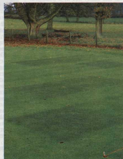
Fig. 3. Experiments at STRI evaluating liquid and chelated iron products for effects on fusarium patch.