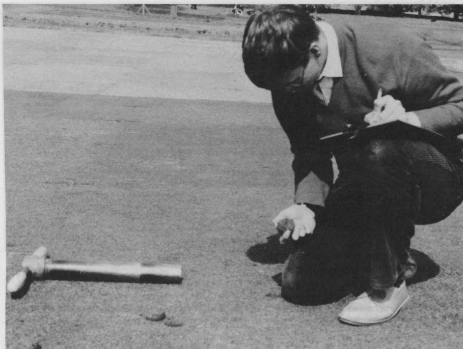
Taking of turf samples for assessment, part of the turfgrass cultivar evaluation programme.