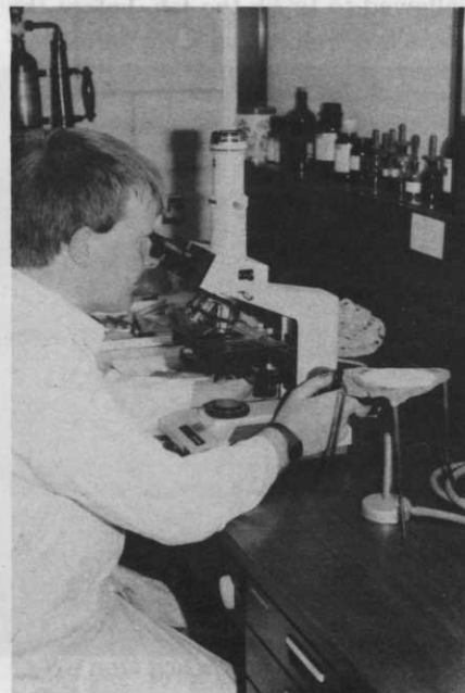
Below: Disease diagnosis of turfgrass specimens by microscopical examination.

Space restrictions will not permit description of the many and varied tests of amenity grass species, wear tolerances or other vital experiments being undertaken. It would take a whole magazine to cover it all. Suffice to say that STRI are doing all that is possible to take greenkeeping safely forward into the twenty first century.