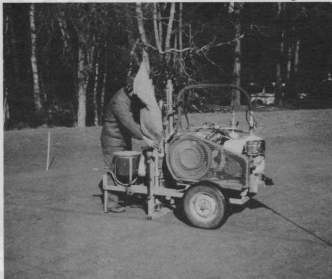
The highly mobile Terralift aerator.

The applications of the Terralift on golf courses are many and varied to include: old greens, poorly constructed new greens, thatch control, tees, wet areas on