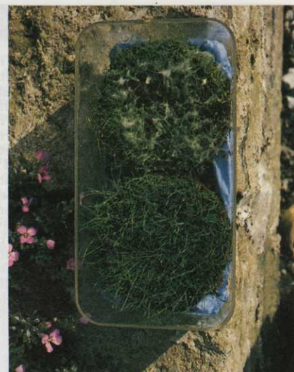
Fig. 1. Effect of moisture on fusarium patch. The rh turf plug, colonised by fungal mycelium has been incubated in damp conditions for 24 hours.

Comprehensive advice on the use of fungicides for the control of fusarium patch is given in "The use of turf fungicides" and "Fusarium patch disease" in Issue No. 165 (April-June 1989) of the Sports Turf Bulletin.