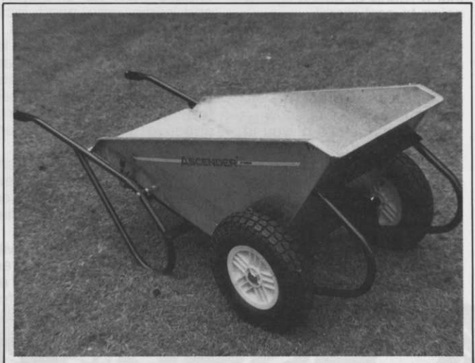
The Ascender lift barrow.