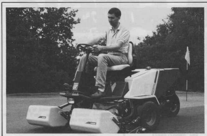
The Ransomes Verti-Groom on Greens Triple mower.