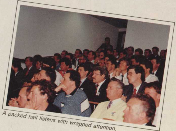
A packed hall listens with wrapped attention.