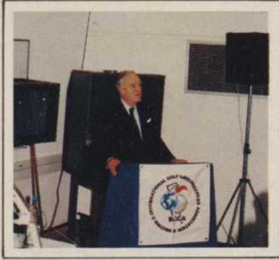
Lord Whitelaw addresses the conference.

Glorious sunshine greeted Saturday's programme – so much so in fact that the lecture theatre became rather warm because of the good weather and also because of the packed audience with some delegates having to sit on the staircases.