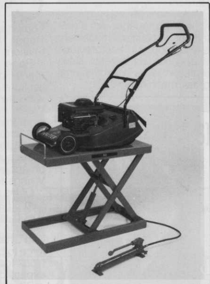
The Junior Groundsman workbench from R & R (UK) Ltd.

The workbench is priced at £399 plus VAT.