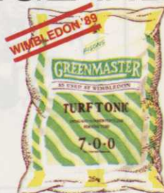
THE SPRING STARTER AND SUMMER TONIC FEED