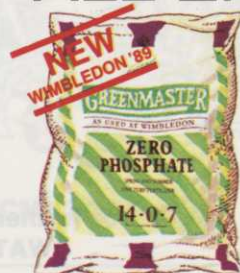
THE PHOSPHATE FREE SPRING AND SUMMER FEED