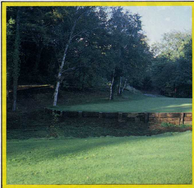
One of the new greens at Dalmling golf course.