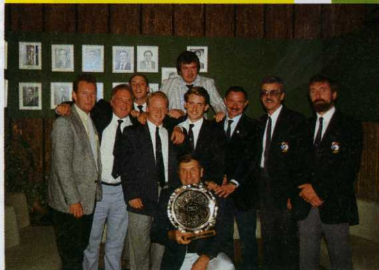
Champions all — the winning Northern Team.