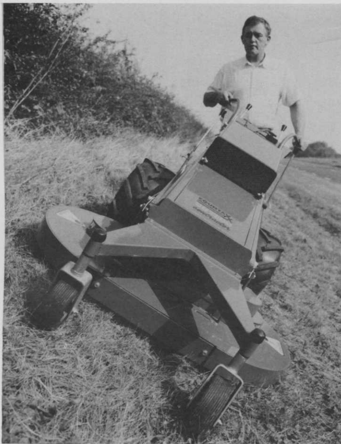
The New Countax CD1200 HDL is a 42in cut, diesel rotary mower with Hydrostatic drive and diff lock.