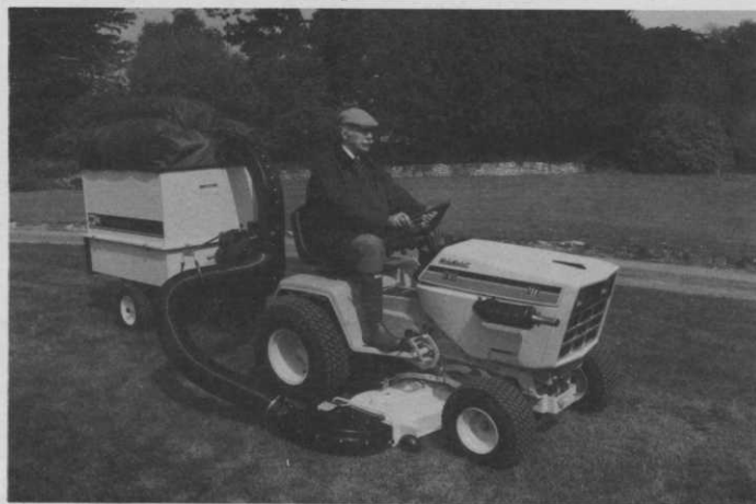
Barrus Cub Cadet Diesel Ride-On Mower with Mow-N-Vac rear collector.