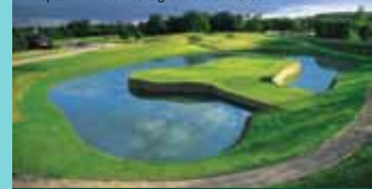
Photo courtesy of Ridding Park Repton Short Course 'Signature Island Green'.

07753 856510 01829 781767 mdownesgolf@live.co.uk