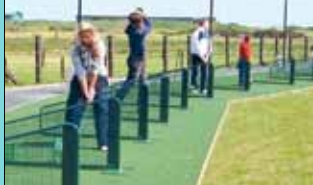
Huxley Practice Tee at St Andrews Links

Top quality practice tees, golf course tees, putting & pitching greens, pathways, patios, cart tracks and lawns professionally designed and installed.