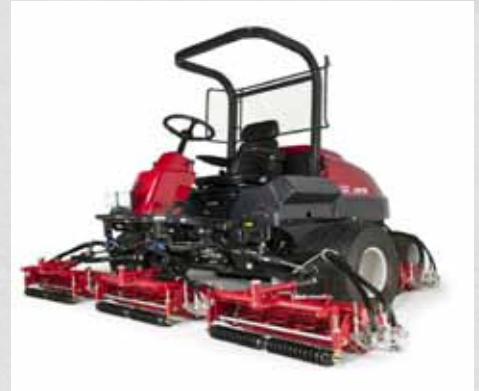
LM2700 Fairway mower