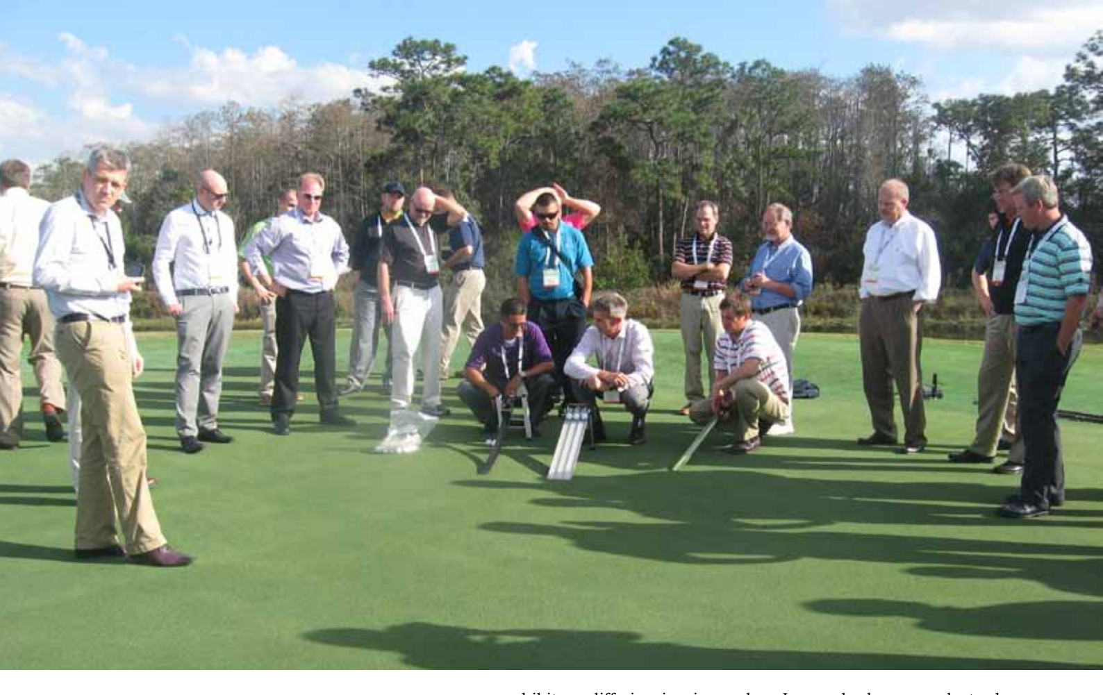
Wednesday 5 & Thursday 6 February The Golf Industry Show, Orange County Convention Centre

The next two days were spent at the GIS and attending educational sessions. The show was vast cover-