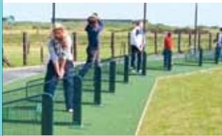
Huxley Practice Tee at St Andrews Links

Huxley Golf PREMIER ALL-WEATHER SURFACES FOR GOLF