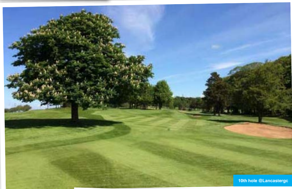
10th hole @Lancastergc