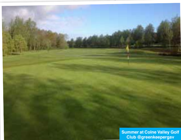
Summer at Colne Valley Golf Club @greenkeepergav