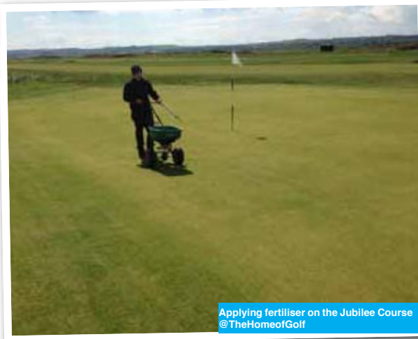
Applying fertiliser on the Jubilee Course @TheHomeofGolf