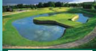
Photo courtesy of Rudding Park Repton Short Course 'Signature Island Green'.

The natural pathway solution 01344 621654 www.theblinder.com