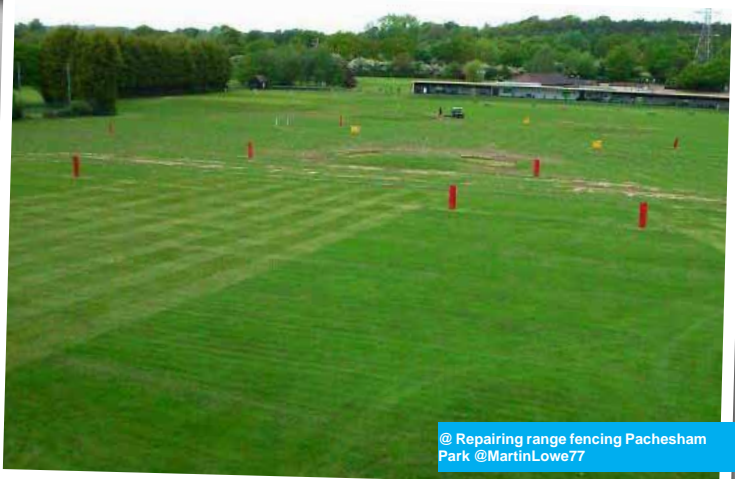
@ Repairing range fencing Pachesham Park