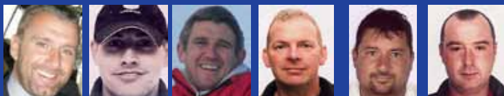
NORTH EAST Glen Baxter glen.baxter@ rigbytaylor.com