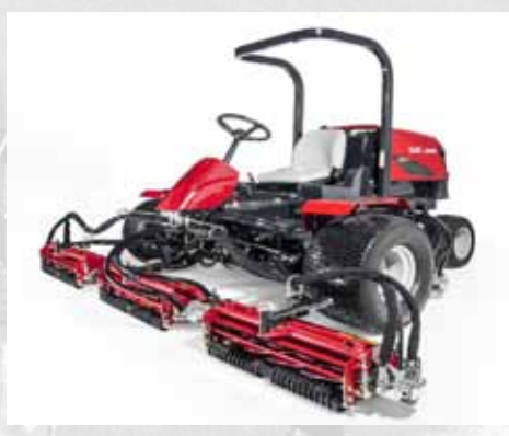
LM2400 Fairway mower