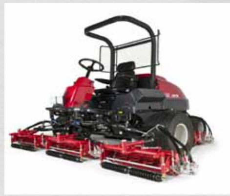
LM2700 Fairway mower