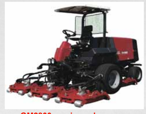
GM2800 semi-rough mower