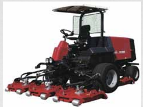
GM2800 semi-rough mower