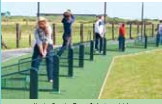
Huxley Practice Tee at St Andrews Links

Huxley Golf PREMIER ALL-WEATHER SURFACES FOR GOLF