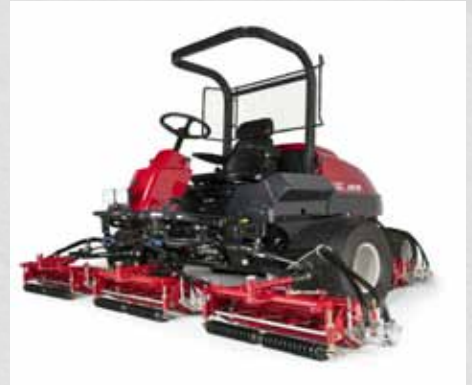
LM2700 Fairway mower