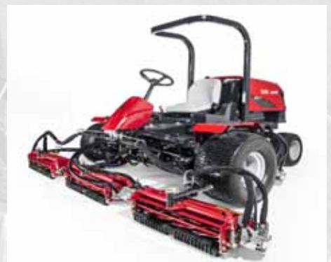
LM2400 Fairway mower