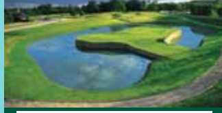
Photo courtesy of Rudding Park Repton Short Course 'Signature Island Green'.

JOHN GREASLEY LTD Specialists in Golf Course Construction