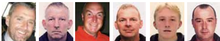
NORTH EAST Glen Baxter glen.baxter@ rigbytaylor.com