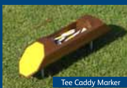
Tee Caddy Marker