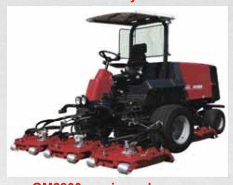
GM2800 semi-rough mower