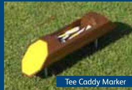
Tee Caddy Marker