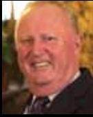
BIGGA President Sir Michael Bonallack, OBE