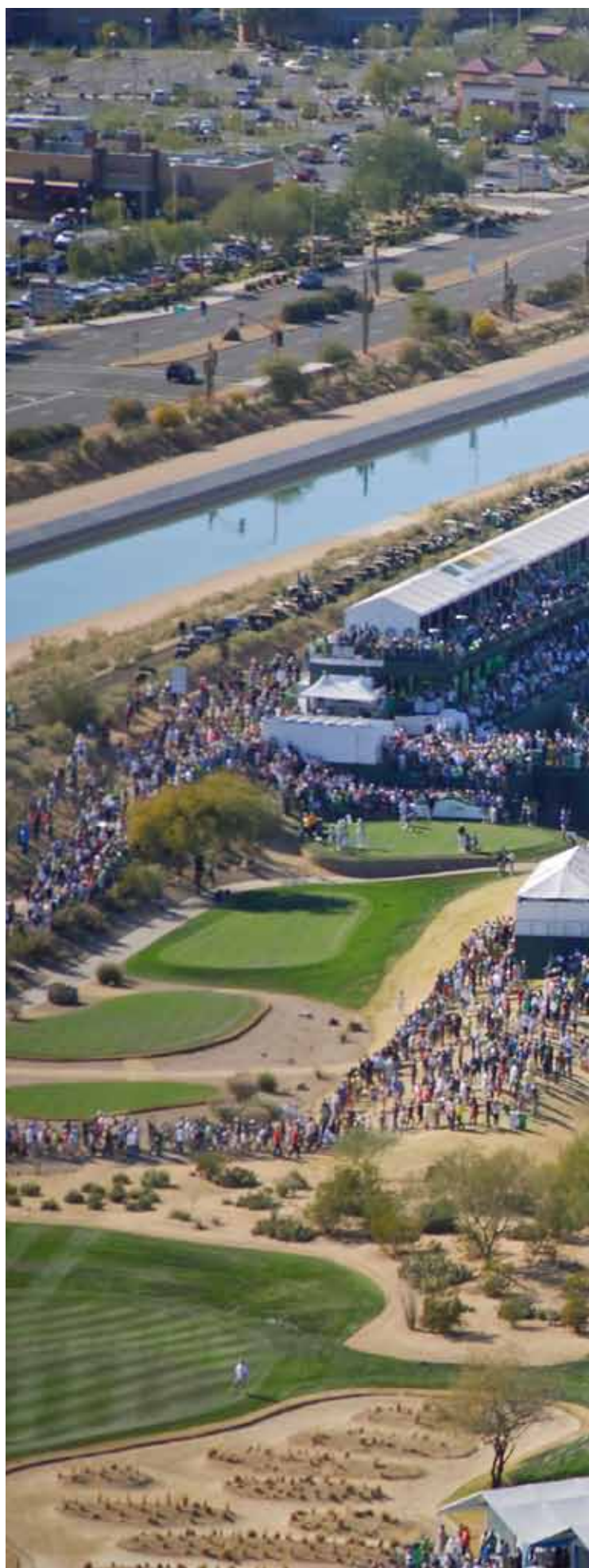
The stand at the 16th

It truly was the experience of a lifetime, all arising from sending a few emails.