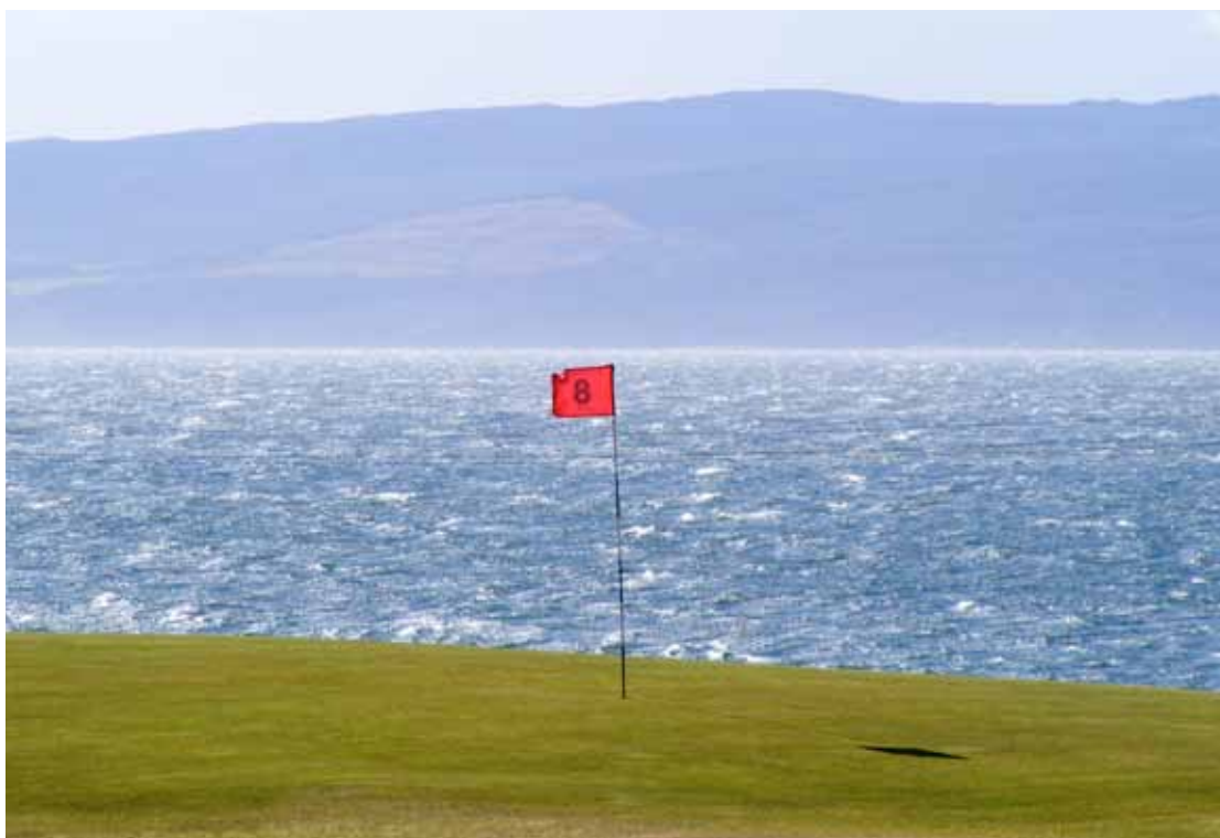
IMAGES ON THIS PAGE OF MACHARIE BAY: The splendid first 1st green (above), 1st tee (far left) and the 8th hole (left)