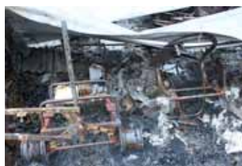
IMAGES OF FIRE DAMAGE, courtesy of Dougarie Estate : TOP: remains of a tractor MIDDLE: two rotary mowers LEFT: Remains of a sprayer, rotary mower and fertiliser spreader