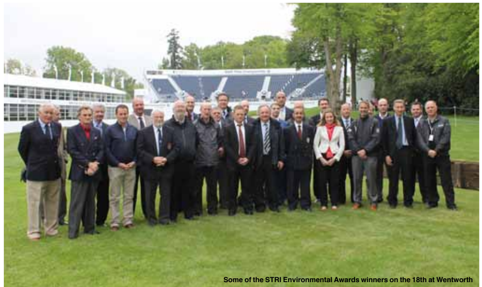
Some of the STRI Environmental Awards winners on the 18th at Wentworth