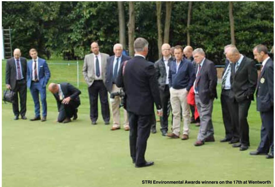
STRI Environmental Awards winners on the 17th at Wentworth

2013 has been hectic year so far for BIGGA and for me in my travels around the Regions and Sections, so a slightly quieter month has come as a welcome change. I was pleased to have the opportunity to attend a Midlands Region board meeting