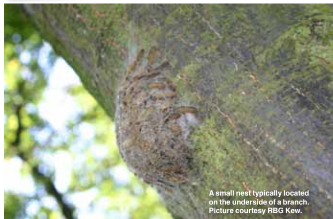
A small nest typically located on the underside of a branch.

( Apatura iris ) known to be on sites nearby.