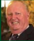
BIGGA President Sir Michael Bonallack, OBE