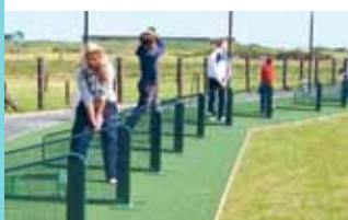
Huxley Practice Tee at St Andrews Links

Top quality practice tees, golf course tees, putting & pitching greens, pathways, patios, cart tracks and lawns professionally designed and installed.