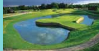
Photo courtesy of Rudding Park Repton Short Course 'Signature Island Green'.