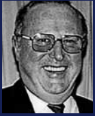
BIGGA President Sir Michael Bonalack, OBE