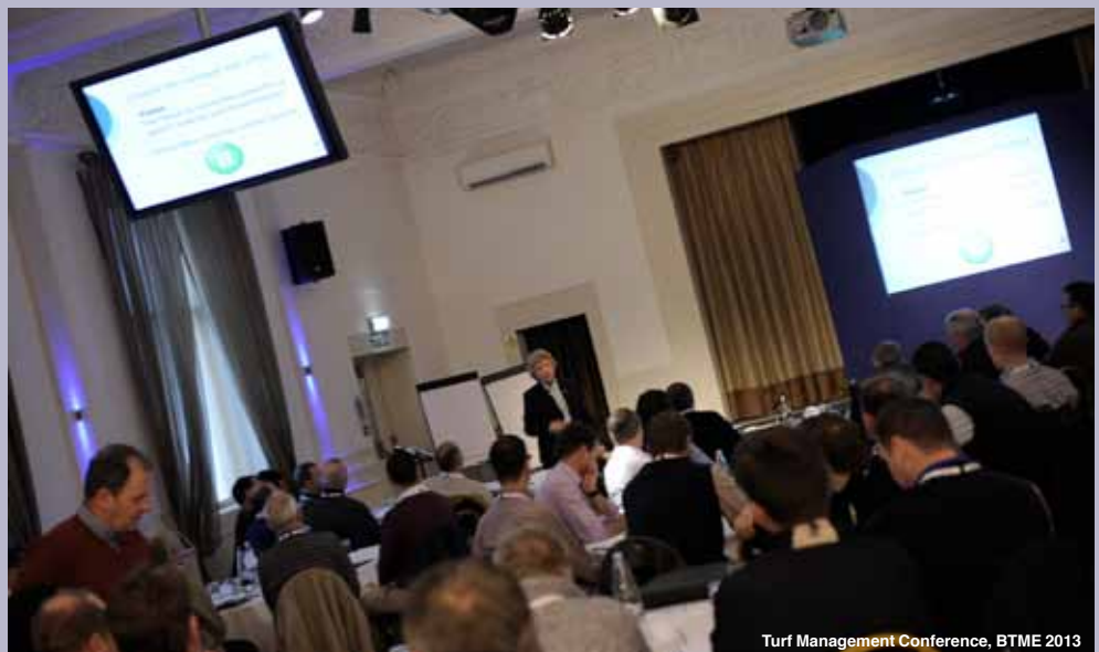
Turf Management Conference, BTME 2013

I made a point of spending an afternoon visiting all the individual workshops in the Queen's Suite. I wanted to thank the lecturers for their exceptional presentations, and also all the delegates for making the most of these vital educational opportunities. They were coming out saying how much they had learnt and would be returning