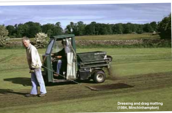
Dressing and drag matting (1984, Minchinhampton)