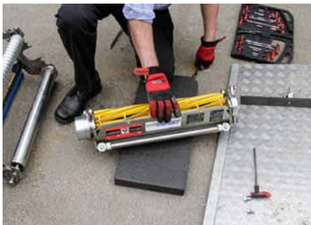
BELOW: Swapping the SMART cassettes

A key advantage of the cassette system developed by ATT is that it was developed as a mower first. The mounting system incorporates a flexible mount that allows the cassette chassis to move in the lateral plain. In work, the cutting cylinder's freedom to follow contours ensures a good cut over undulations with a reduced risk of scalping. An added