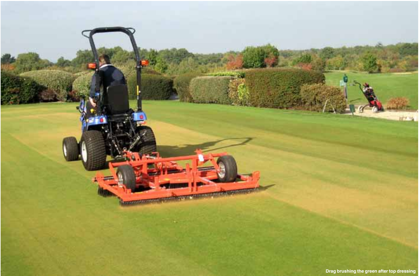
Drag brushing the green after top dressing

the use of hover mowers to blow the sand into the turf canopy has been used in recent times.