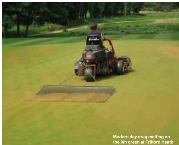
Modern day drag matting on the 9th green at Frilford Heath