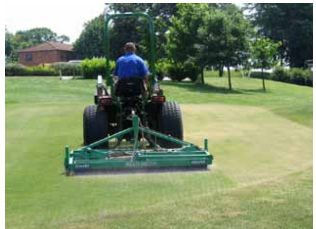
ABOVE: Brushing in top dressing using Greentek Multi-brush (Cotgrave Place) BELOW: Sweep n Fill brushing sand dressing into core holes (West Hill)

In warmer and drier climates this is perhaps less of an issue but in our cool temperate climate, this is harder to achieve, especially if the sand is wet or even just damp. Purchasing the more expensive kiln dried sand still requires a dry surface; by no means a guarantee