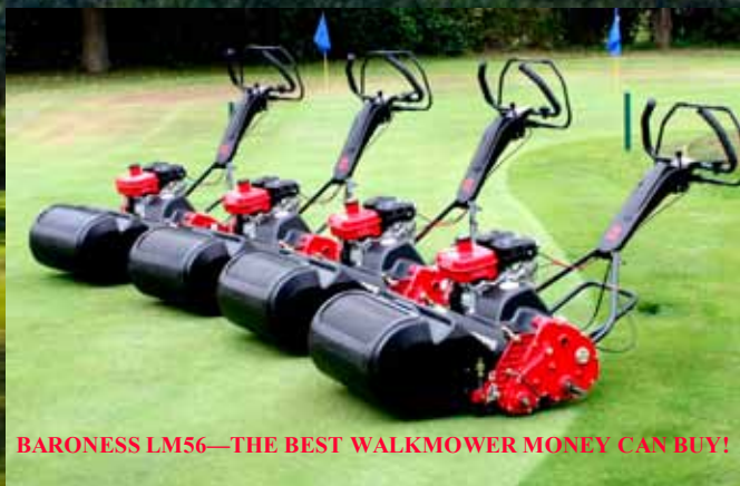
BARONESS LM56—THE BEST WALKMOWER MONEY CAN BUY!