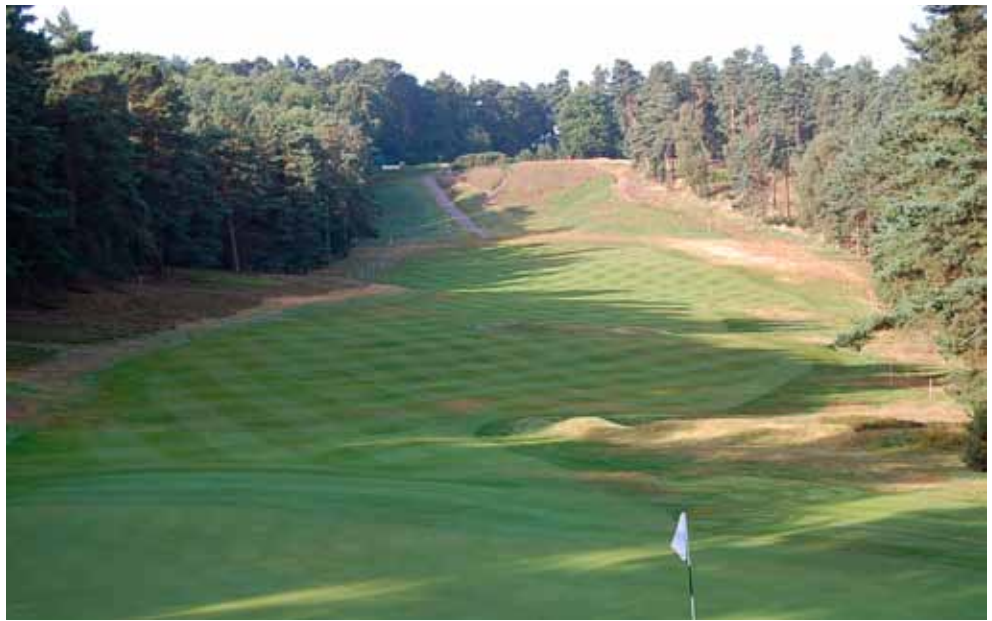
Sunningdale GC, 5th on the new course (below)

The application of weather forecasting could become more widespread thanks to a new computer model from the Met Office that can better predict cold winter weather a season ahead.