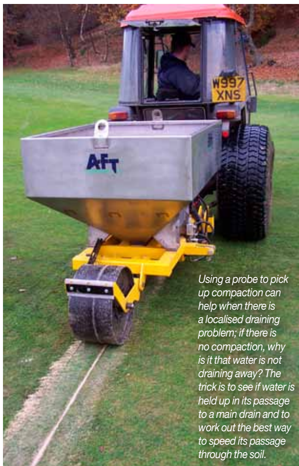
Using a probe to pick up compaction can help when there is a localised draining problem; if there is no compaction, why is it that water is not draining away? The trick is to see if water is held up in its passage to a main drain and to work out the best way to speed its passage through the soil.

• Tyres and compaction. If possible, reduce the inflation pressure of equipment tyres to the permitted minimum. With trailers and turf trucks, avoid overloading