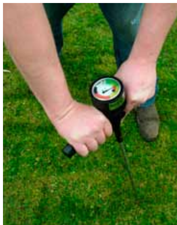
LEFT: Slit trenchers come in a variety of designs and can be used to apply a band of material from the turf surface down to the water table. Operated correctly, these tools can help improve local drainage issues economically, but sound primary draining is also important. On larger jobs it pays to work with a drainage specialist.

• Plan supplies. When ordering drainage project supplies, seek advice to source the most appropriate materials