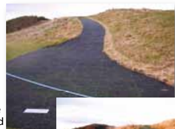
Before and after the application of rubber mats

☎ 01253 342003 ✉ tebbuttasso@btconnect.com www.tebbuttassociates.com