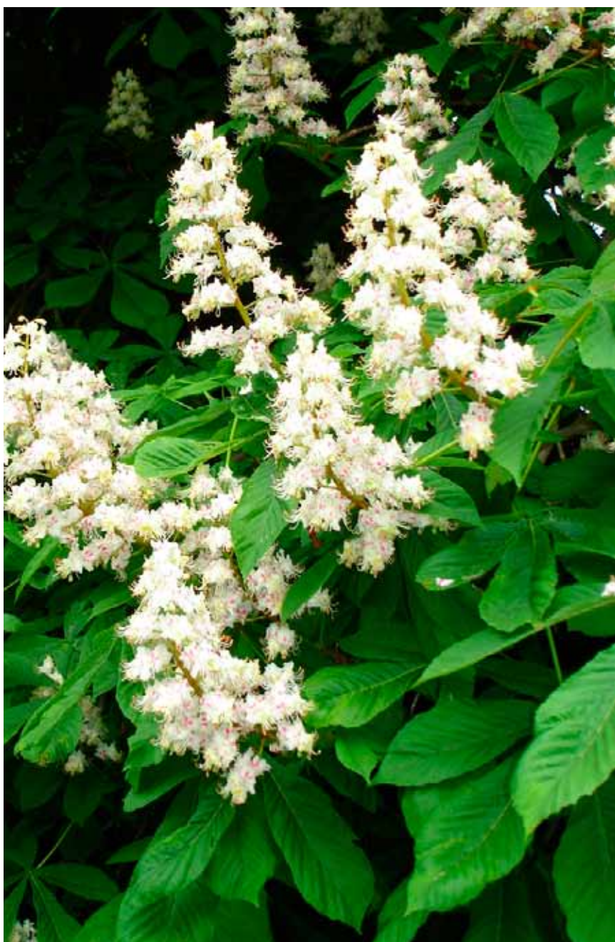
RIGHT: Horse chestnut 1. White flowering horse chestnut

Until recently both were popular trees for planting in all sorts of amenity, landscape and sporting situations including golf courses. However, virtually no horse chestnut is now being planted due to activity of the horse chestnut leaf miner, which although not fatal ruins the summer canopy of white flowering horse chestnut, and bacterial bleeding canker a bark