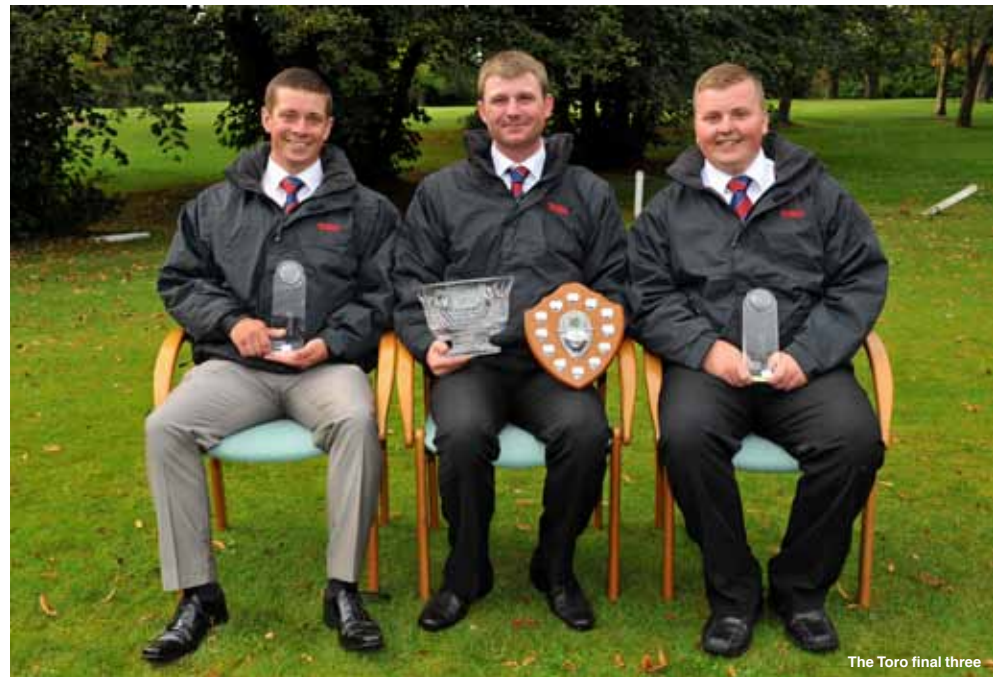
The Toro final three

ISSN: 0961-6977 © 2012 British and International Golf Greenkeepers Association Limited