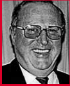
BIGGA President Sir Michael Bonallack, OBE