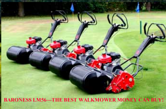
BARONESS LM56—THE BEST WALKMOWER MONEY CAN BUY!