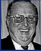
BIGGA President Sir Michael Bonallack, OBE