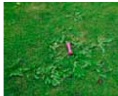
If carbendazim 'the last lumbricide' is eventually lost any gain in reduced pesticide loading will be more than compensated for by the extra herbicide required to control a much larger and wider weed population on greens and tees.

although current scrutiny is on its role in agriculture where the tonnage used is large and the application is much more broadly based than on turf.