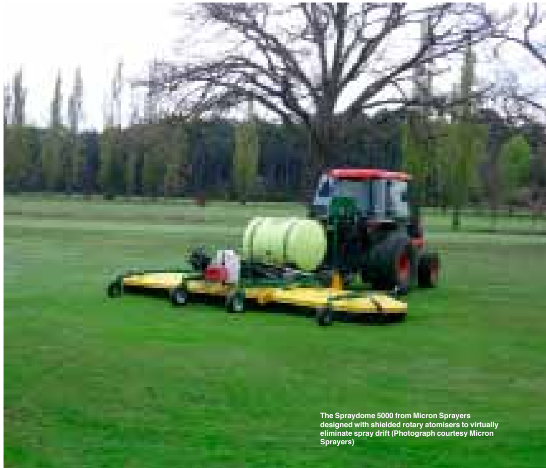
The Spraydome 5000 from Micron Sprayers designed with shielded rotary atomisers to virtually eliminate spray drift

Chlorpyrifos, the only sprayable insecticide for control of leatherjackets in turf, is the latest pesticide to stand in the spotlight,