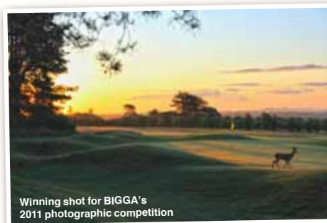
Winning shot for BIGGA's 2011 photographic competition