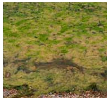
MAIN ABOVE AND INSET ABOVE: Filamentous algae – known as 'blanket-weed' or 'cott'

There are no longer any chemicals available to control algae in water in Europe. However, dealing with the problem is a simple matter