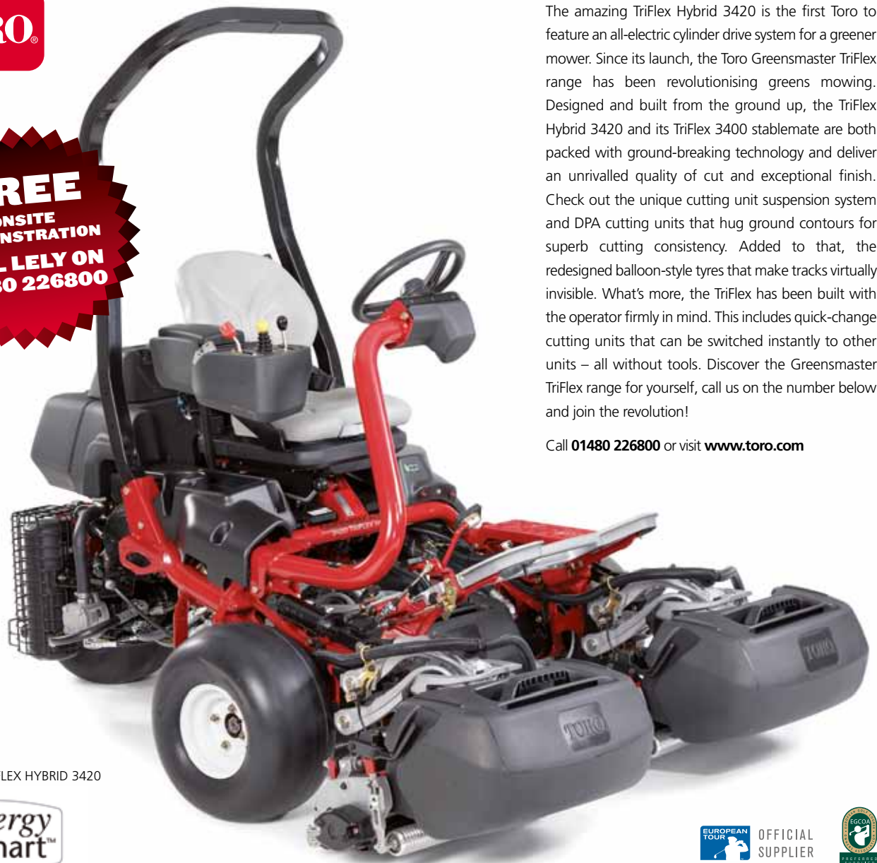
GREENSMaster TRIFLEX HYBRID 3420

FREE ONSITE DEMONSTRATION CALL LELY ON 01480 226800