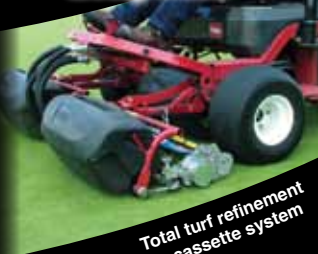
Total turf refinement cassette system