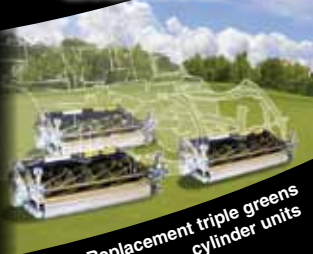
Replacement triple greens cylinder units