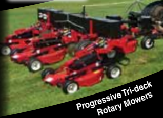
Progressive Tri-deck Rotary Mowers