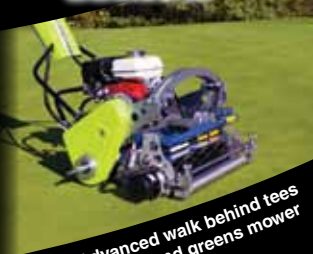
Advanced walk behind tees and greens mower

...for a great deal visit www.thegrassgroup.com or call 01638 720123