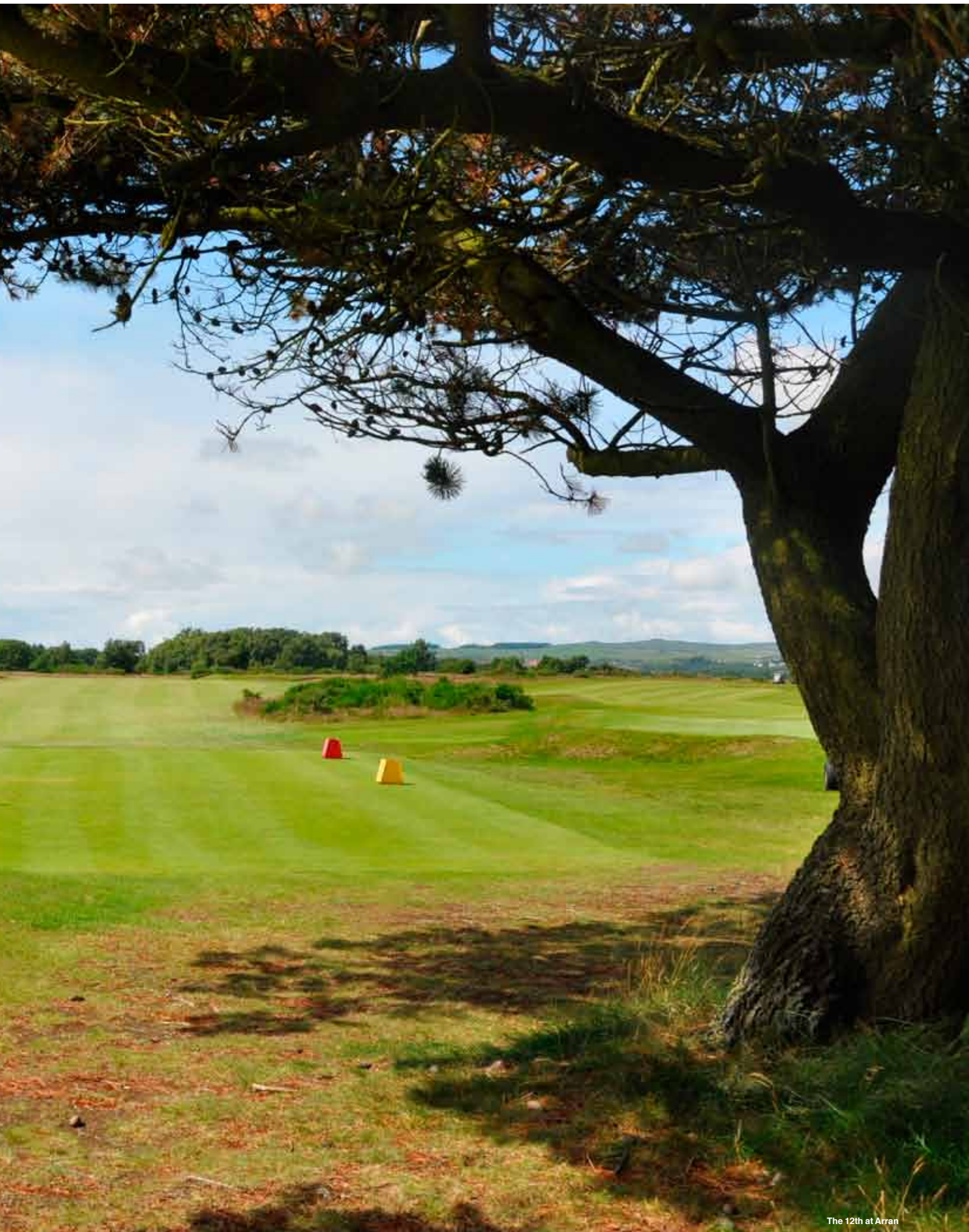
The 12th at Arran