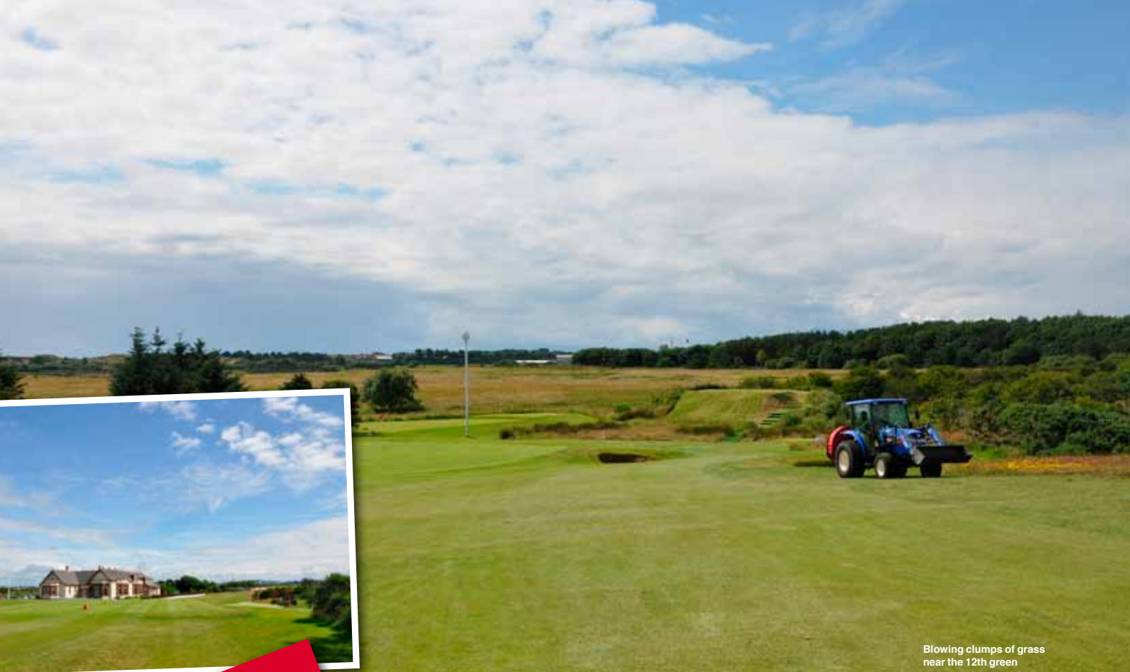
Blowing clumps of grass near the 12th green