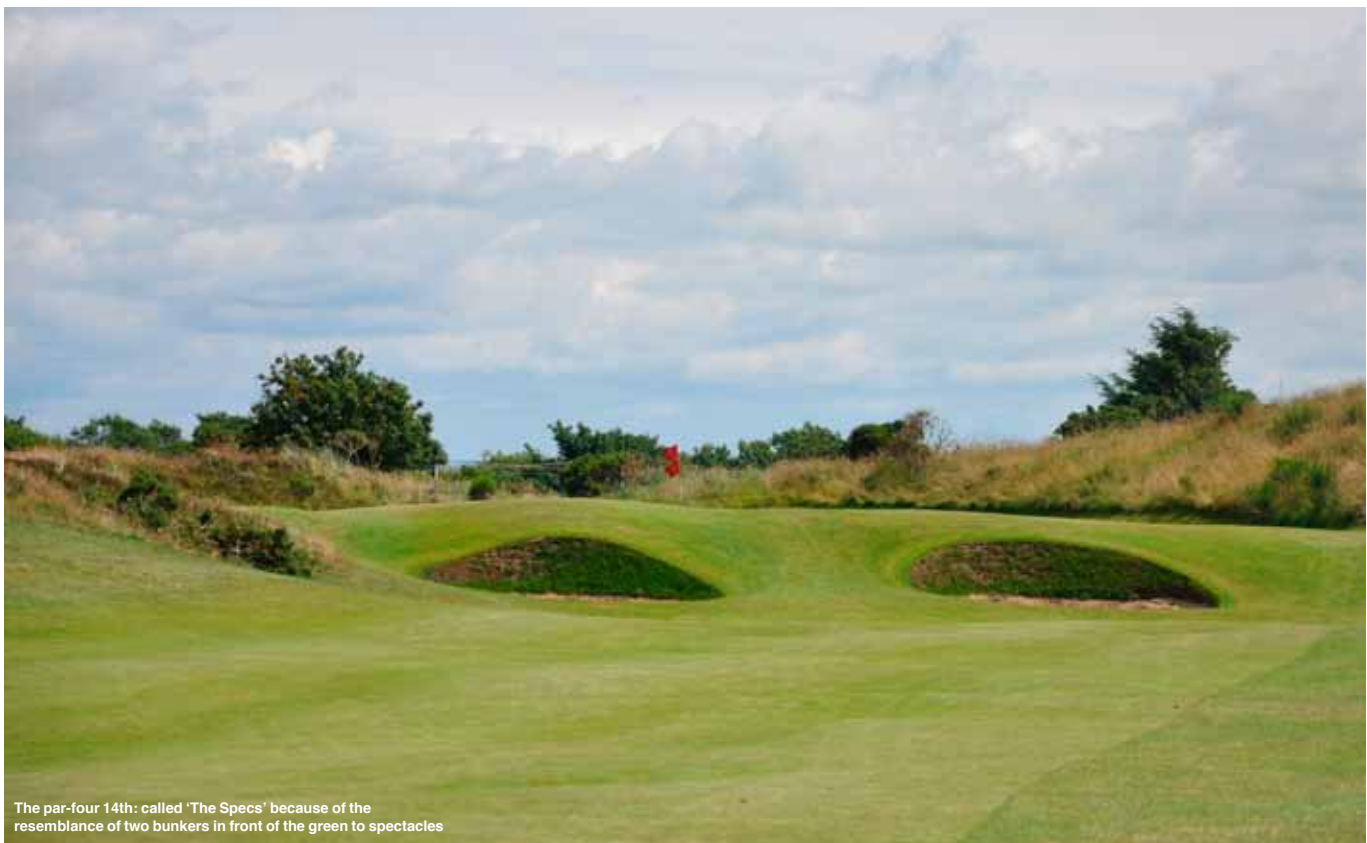
The par-four 14th: called 'The Specs' because of the resemblance of two bunkers in front of the green to spectacles

John Deere 3235B fairway mower Toro Sidewinder with rotary heads John Deere triple mower Jacobsen Mk 4 greens cutter 6 x Jacobsen 523B hand mowers (3 older model and 3 newer) Iseki Tractor John Deere 955 compact tractor Wiedenmann Terra Spike verti-drain John Deere Hercore aerator Ransomes 180 diesel