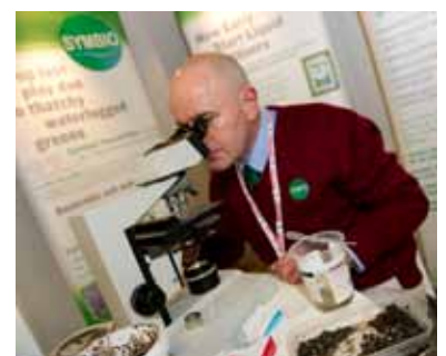
IMAGES: A selection from BTME 2012