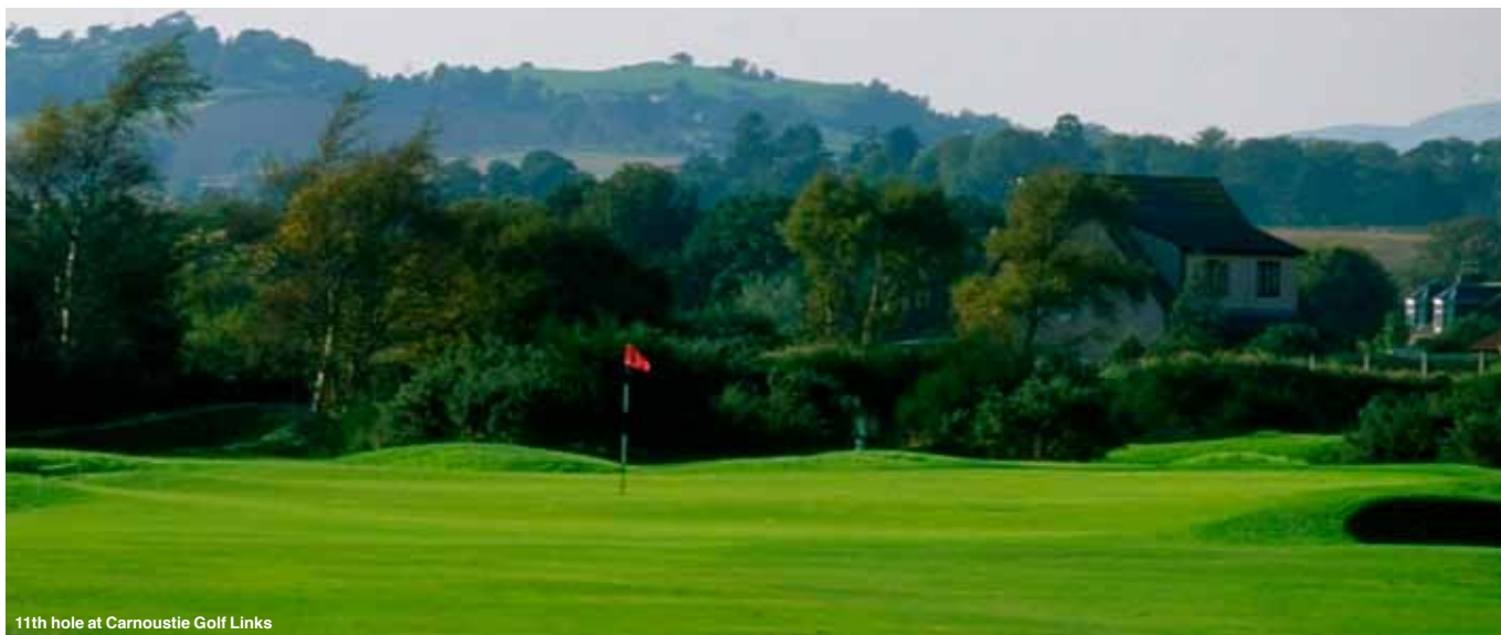
11th hole at Carnoustie Golf Links