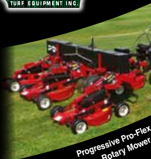
Progressive Pro-Flex Rotary Mower