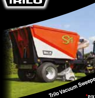
Trilo Vacuum Sweeper *P/X available