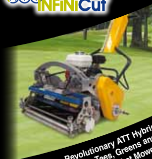
Revolutionary ATT Hybrid Tees, Greens and Cricket Mower