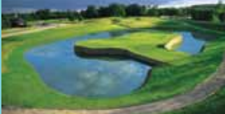
Photo courtesy of Ridding Park Repton Short Course 'Signature Island Green'.