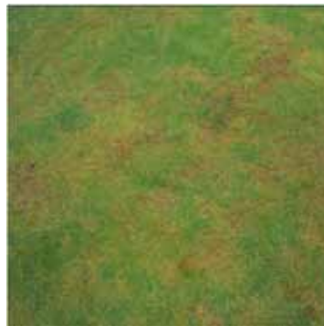
Fig. 3(TOP) and 4 (SECOND TOP) . Rapid Blight in the UK, 2011. General symptoms and close-up

ABOVE: Fig. 5. General symptoms of Brown Ring Patch (Waitea Patch) in the UK, 2011