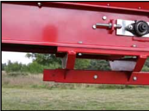
The drawbar of trailed Rink spreaders can be adjusted to suit the towing vehicle, the unit suiting tractors of 25hp plus with one double acting remote valve and delivering 25 l/min hydraulic flow.

On smaller models, both mounted and trailed, there may