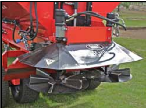
The contra rotating spinning discs can be set to spread at widths from around 2.0 to 12.0m, with variable application rates from light to heavy. Quick couplings enable the discs to be removed for direct dropping into a windrow for trench filling or be replaced with a cross conveyor.