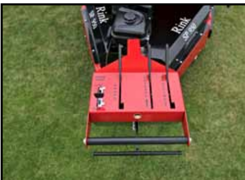
The Rink SP950 controls are simple, the operator engaging drive by raising the 'T' bar. In work, the units forward speed can be adjusted via the engine throttle, the unit proving simple to operate and match up between bouts passes.