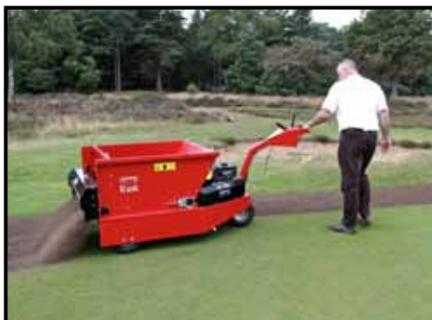
New to the UK, the pedestrian controlled Rink SP950 has a capacity of 0.33 m 3 and a spread width of 950mm. Powered by a 6.5hp Vanguard petrol engine, the units is ideally suited to spreading over small greens and areas of turf with restricted access.