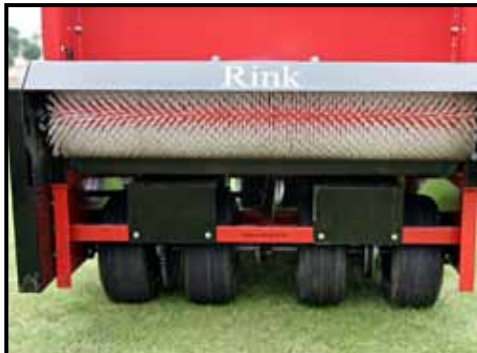
The Rink SP950 runs on six 13x6.50-6 tyres, four at the rear and two up front. The full width nylon brush helps ensure spread material is applied in an even layer and follows the same design as existing Rink top dressers.