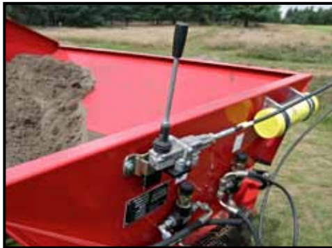
Pictured in its storage bracket, the single lever control for Rink DS top dressers will control the discharge conveyor; the rear discs continue to spin when the discharge conveyor stops. The conveyor, rear shut off and discs draw power from a single hydraulic outlet, this ensuring the unit cannot be operated without