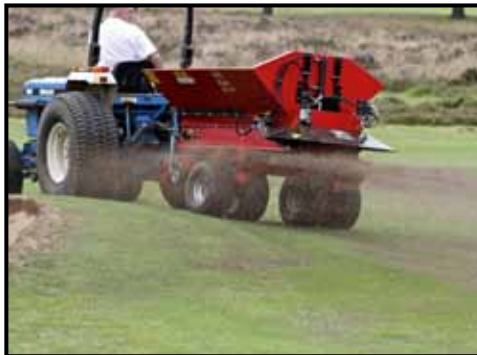
Swing axles ensure the wheels of trailed Rink DS models retain full ground contact over undulations. With any model of top dresser, the amount of material loaded can be cut down to reduce ground bearing pressures.