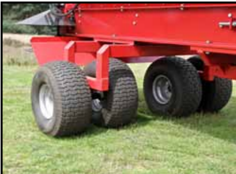
By spreading the load across four wheels, a trailed top dresser can offer a low ground bearing pressure. In the case of the Rink DS800, the four 24x13.00-12 tyres are inflated to 0.8bar.