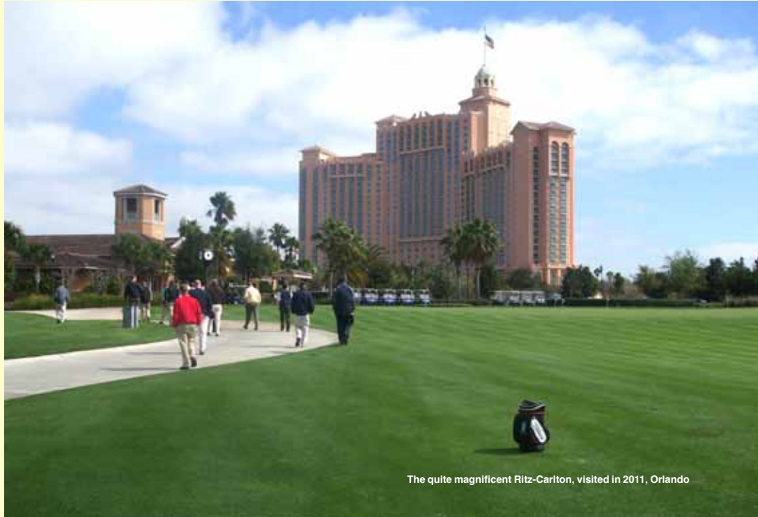
The quite magnificent Ritz-Carlton, visited in 2011, Orlando

And if you have any doubts about what you would get out of such a trip just take a few minutes to read what two former Delegates got out of their particular weeks.