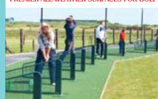
Huxley Practice Tee at St Andrews Links

Huxley Golf PREMIER ALL-WEATHER SURFACES FOR GOLF