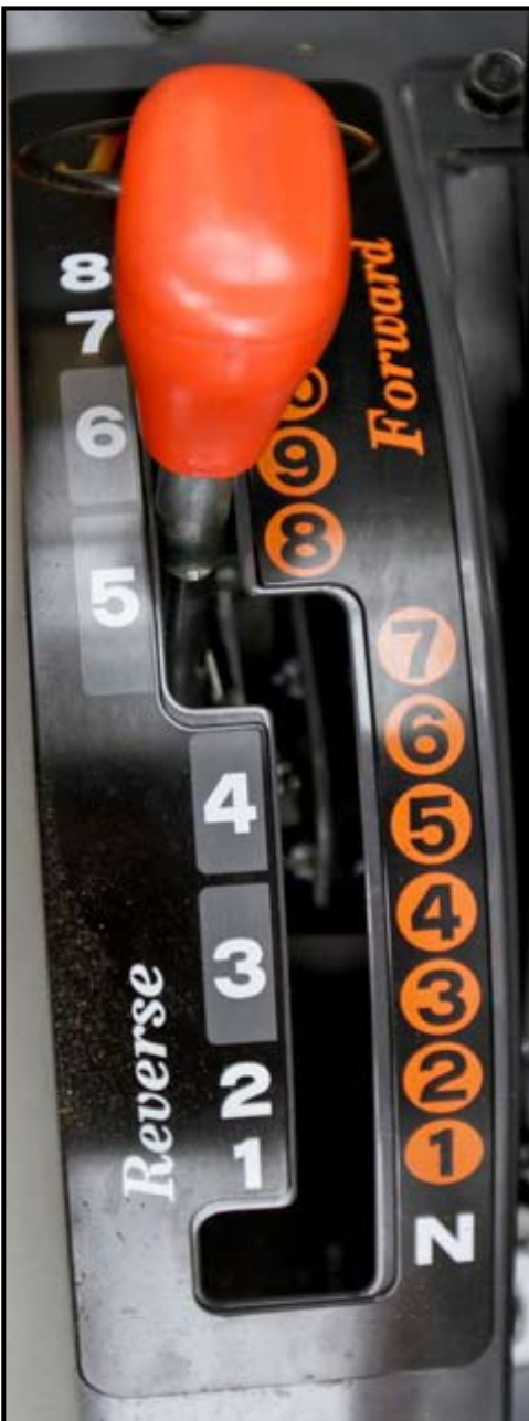
Swapping ratios on the GST transmission is simple; just move the gear selector to choose the desired ratio. This does not mean the tractor can be started in any gear but it does mean the operator can swap ratios on the move without using the clutch.