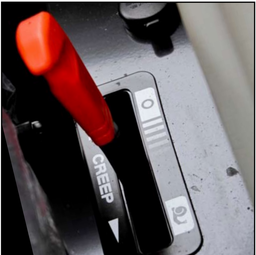
Creep speeds are selected via the separate lever above the main shift and provide a forward speed as low as 0.20km/hr. Once in the creep range, all eight speeds on offer are available.