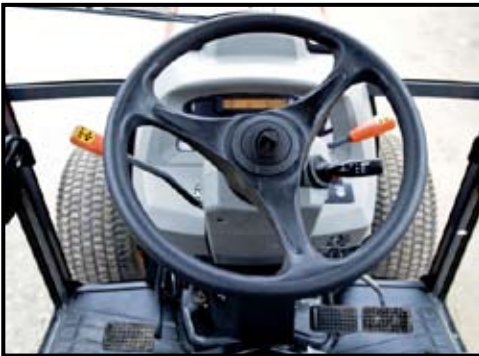
The dash of GST transmission models features a power shuttle lever to the left. The clutch pedal can be used when inching up to hitch attachments but otherwise can be pretty much left alone; drive engages as the engine is throttled up, with no need to use the clutch to swap ratios.

Kubota is not claiming this fixed' drive ability is a unique HST Plus feature. Both the John Deere eHydro hydrostatic and New Holland EasyDrive CVT transmissions offer similar abilities. But not everyone wants this type of transmission, preferring instead a mechanical