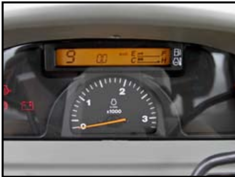
The IntelliPanel on GST L5040 tractors shows the selected gear on the left. In work, the gears can be swapped without using the 'clutch'. When the power shuttle is used to change direction, the clutch is again not required.