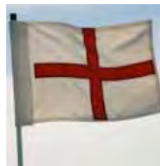
MAIN ABOVE: Trying to counter the drought INSET ABOVE: St George's uses its namesake flag on their pins LEFT: The Maiden's Bunker RIGHT: The iconic St George's Starter's Hut