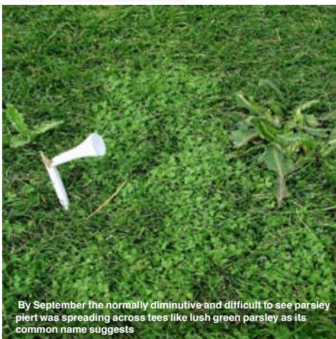
By September the normally diminutive and difficult to see parsley piert was spreading across tees like lush green parsley as its common name suggests

to increasingly severe summer drought conditions] because selective herbicides are never applied during extended periods of dry weather when the grass is not actively growing. But on the other side of the global warming 'coin' are predicted wetter winters with the classical December-February UK winter period squeezed at both ends by extended autumns and earlier springs.