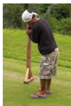
ABOVE: Not regarded as suitable footwear in Europe! BELOW: Caddies say, "Hi"