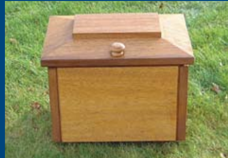
Seed & Divot Boxes