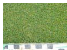
Annual meadow grass sward (left) and fescue sward, both mown at around 4 mm