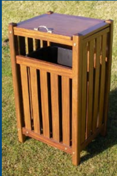
Handmade Timber Bins