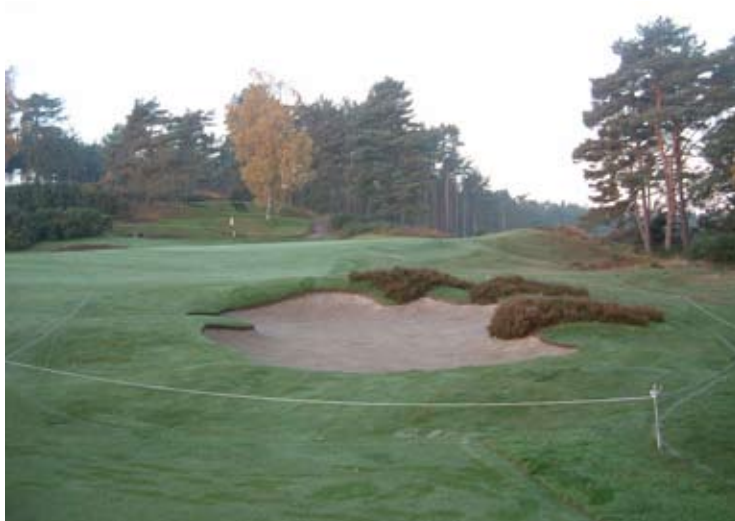
ABOVE: bunkers before and BELOW: after re-construction

When it comes to bunker maintenance, different raking techniques can be used to help you achieve your