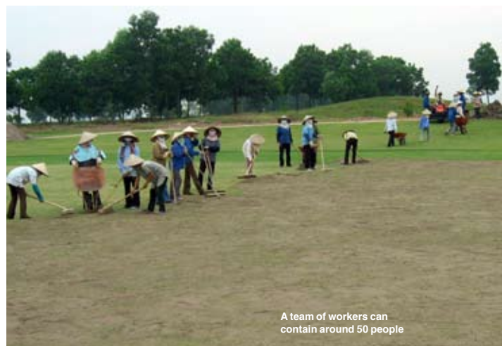
A team of workers can contain around 50 people

Because the climax vegetation in Southeast Asia tends toward jungle, it is a matter of constant effort and constant vigilance on the