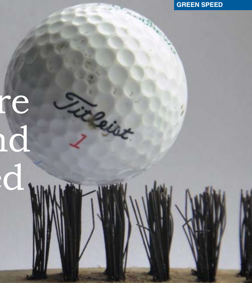
Golf ball on a wire brush (left) and on a toothbrush

Tim Lodge raids his bathroom to produce visual aids illustrating his take on green speed