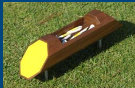
Augusta Caddie Markers