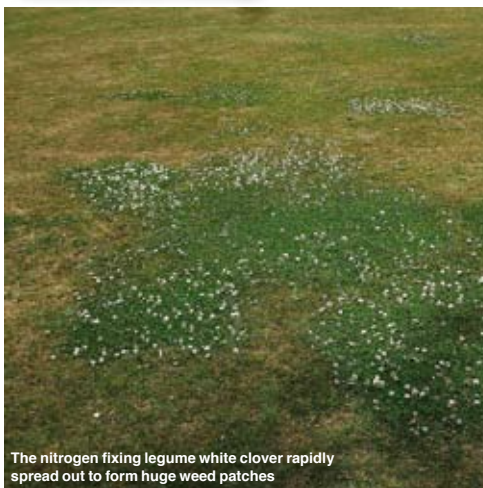
The nitrogen fixing legume white clover rapidly spread out to form huge weed patches