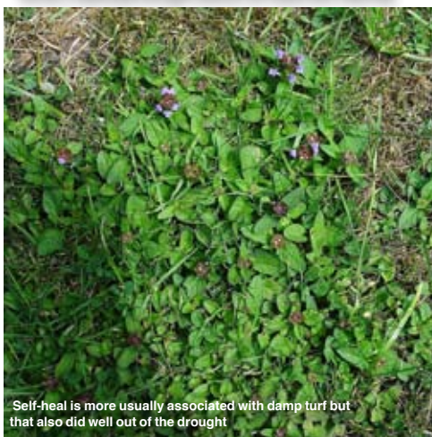
Self-heal is more usually associated with damp turf but that also did well out of the drought