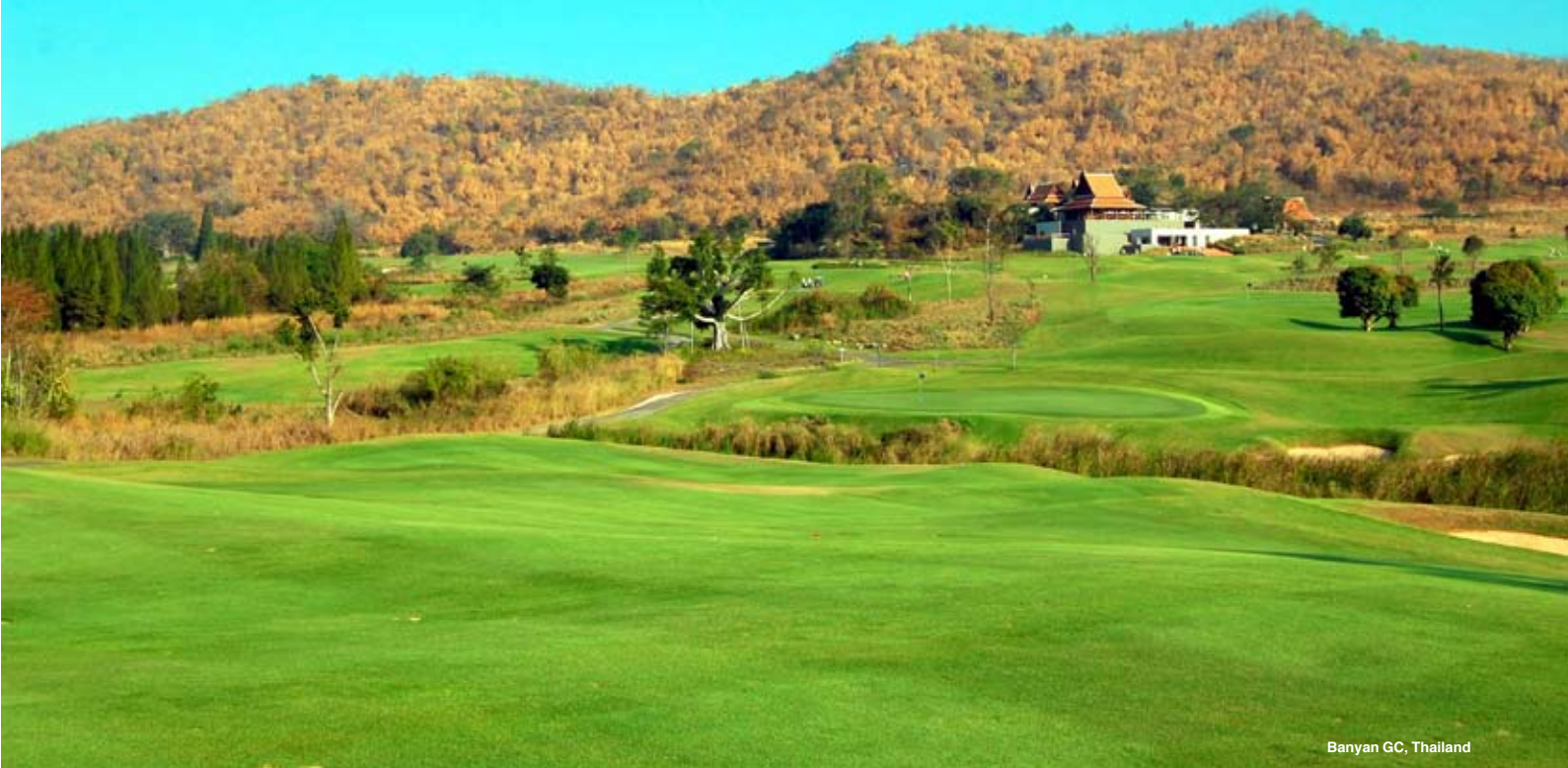
Banyan GC, Thailand

routine job when one must get to work by bicycle or motorcycle, and it is understandable that one would want to have a better quality of life and a car or truck. And when we pass vast expanses of rice fields and see workers spraying insecticides and herbicides with no protective gear, we may cringe a bit, but that is commonplace in Southeast Asia and food production is a lot more important than is golf course maintenance.