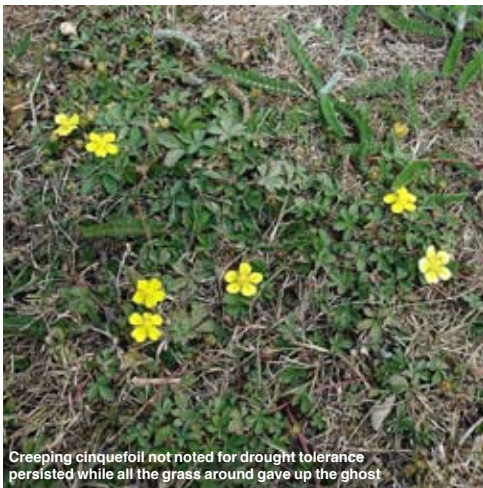
Creeping cinquefoil not noted for drought tolerance persisted while all the grass around gave up the ghost