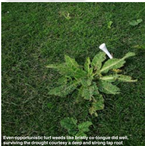
Even opportunistic turf weeds like bristly ox-tongue did well, surviving the drought courtesy a deep and strong tap root