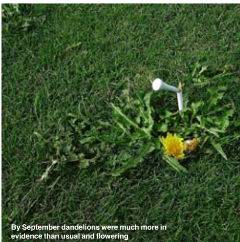
By September dandelions were much more in evidence than usual and flowering