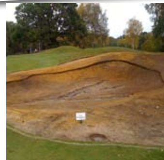
ABOVE: Range of photographs showing new Course bunkers under construction

stones. This is the ideal. I wish this ratio was higher, but it does give some indication of what is needed in a good bunker!