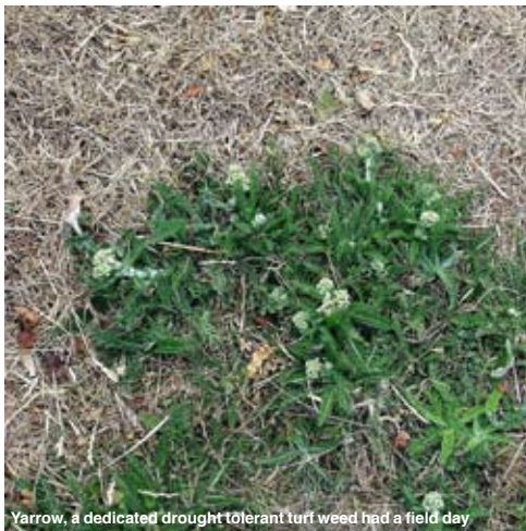
Yarrow, a dedicated drought tolerant turf weed had a field day