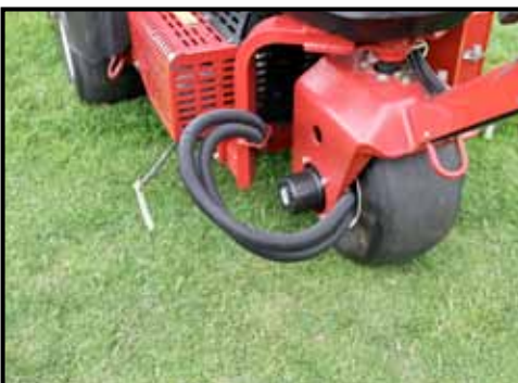
Simple tricycle undercarriage allows good contour following. Steering king pin is one of the few grease points on the machine.