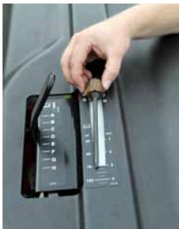
A decal adjacent to the depth-setting lever enables the setting to be set to accommodate tine wear. Not collar on tine. This is part of the QuickChange system.

In work, the ProCore obviously vibrates as does the ground as the tines penetrate the surface of the turf. But vibration passing through to the operator is well controlled.