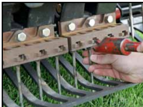
The Toro QuickChange system was introduced in 2010 and is a retrofit option for existing ProCore 648 pedestrian and mounted 864 and 1298 models.