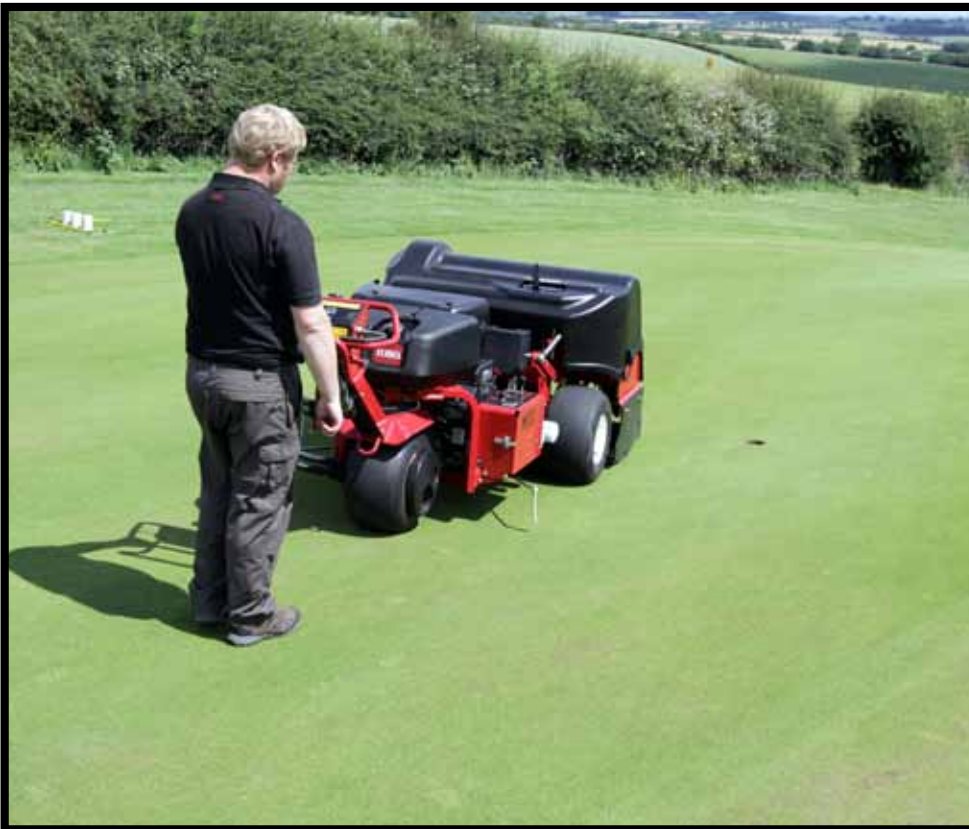
When working with needle tines, the operator can use fold out markers to assist aligning bout passes.. It does not take long to aerate a green, the total time required to cover 18 holes needing to include the time to move between. The latter can take longer than the aeration itself!

Superseding its Pedestrian Greens Aerator in 2006, the Toro ProCore 648 is now well established. Offering a 48in/122cm working width, the unit can be fitted with needle, solid, side-eject and hollow tines in diameters of 5 to 16mm and can work down to a maximum of 102mm. But is it really that different from its predecessor?