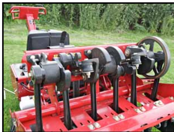
Balanced crank has numbered connecting rods to ensure they are re-matched following a major overhaul. Note vibration isolation blocks.

The ProCore 648 is a well-engineered item of equipment.