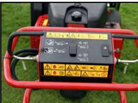
Once set up, operating the ProCore is straightforward. The only complexity is trying to decipher the warning on the decals.

Toro has done a good job with the design of the ProCore 648, but the optional QuickChange system would be even better if it came as standard. At present it adds an extra £680 to the unit's £18,507 list price. On the plus side, existing users can retrofit QuickChange.