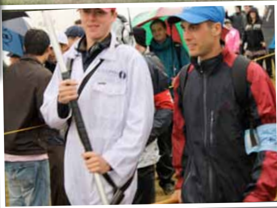
MAIN PHOTO: The triumphant BIGGA Open Support Team